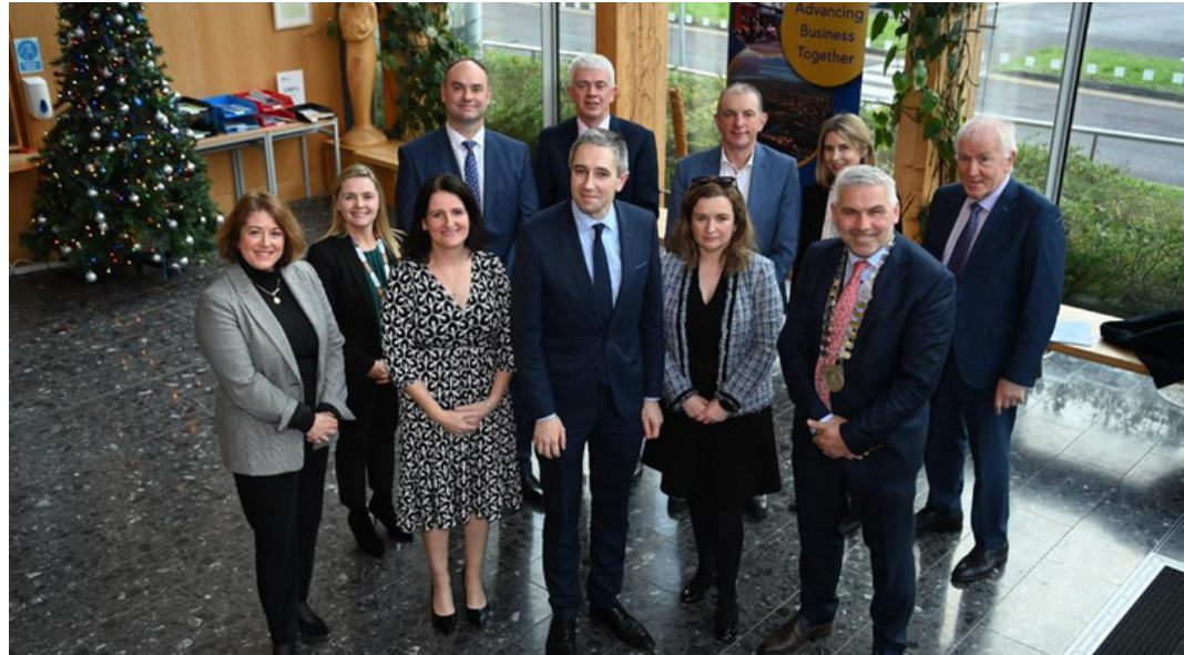
Members of the Tralee Chamber Board pictured with An Taoiseach, Simon Harris.